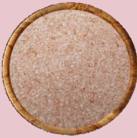
LPS - 02 Light Pink Cooking Salt Fine Grain