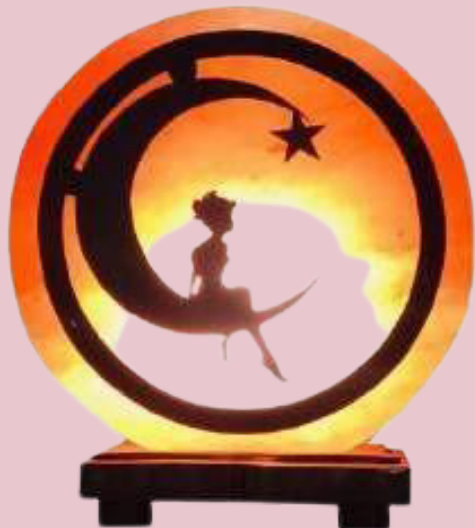
NA : 07 Girl on Moon