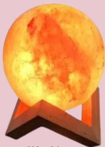
NA : 01 Moon Light