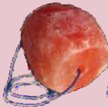
LS : 07