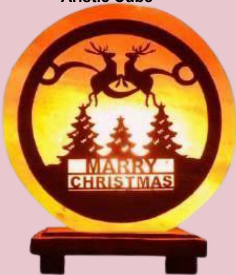
NA : 05 Marry Christmas