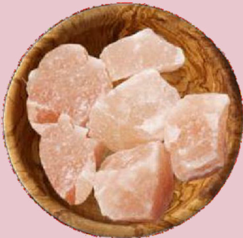
LPS - 06 Light Pink Salt Size 3-5 cm Chunks