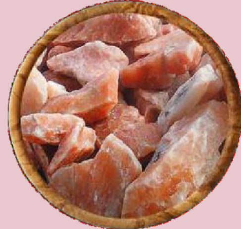
LPS - 08 Light Pink Salt Size 05 KG -20 KG