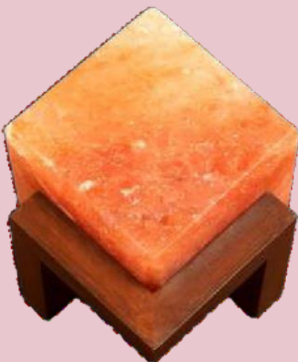
NA : 02 Aristic Cube