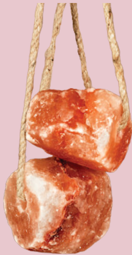
LS : 02

Hanging Salt Rocks Licks 1 ~ 2 kg Per Piece