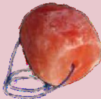
LS : 06