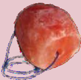
LS : 05

Hanging Salt Rocks Licks 4 ~ 5 kg Per Piece