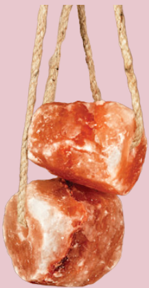
LS : 01

Offering Best Himalayan Mineral Salt for your Animals. The distinctive pink color comes from the salts mineral content Such as Iron, potassium and magnesium, which are vital for maintaining health of Cows/sheep/goats horses, all have a very well defined appetite for sodium chloride (SALT) only surpassed by the need for water. Because the majorities of plants do not provide sufficient sodium for the livestock/horses needs and may lack adequate chloride, salt supplementation is a vital part of any animal's nutritional requirement