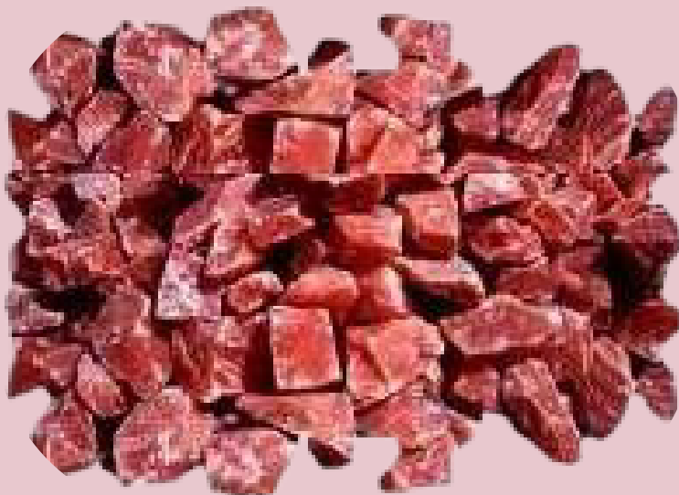
Red Rock Salt Animal Licking 2 – 10 kg