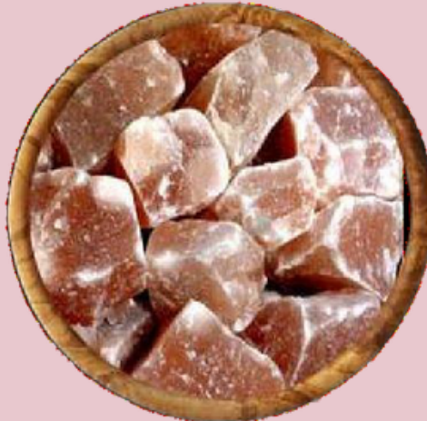
LPS - 07 Light Pink Salt Size Lumps 1-10 KG