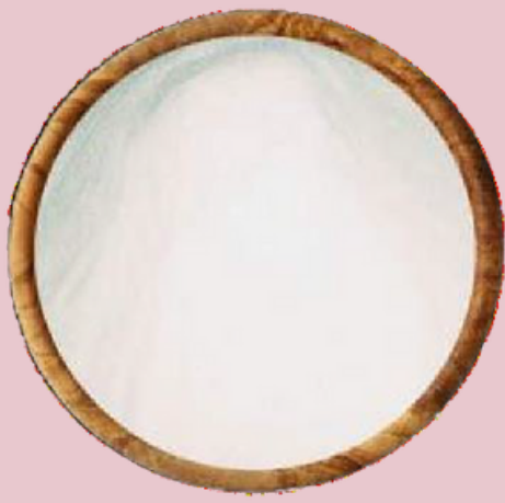
LPS - 01 Light Pink Salt Powder