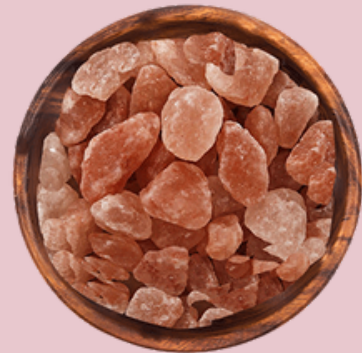
DPS- 05 Dark Pink Salt Size 2 ~ 3 cm chunks