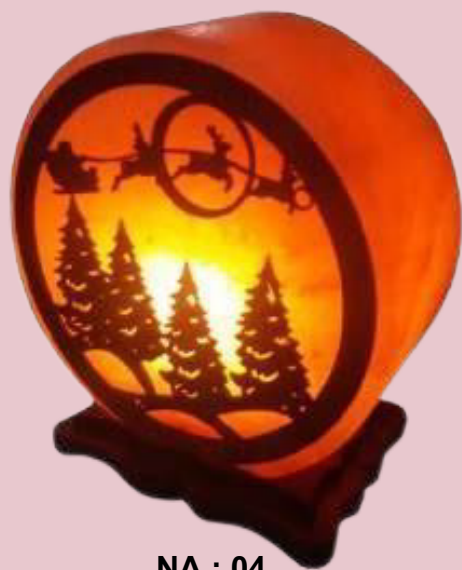
NA : 04 Trees