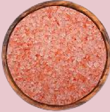
DPS-02 DARK PINK SALT COOKING GFNE GRAINS