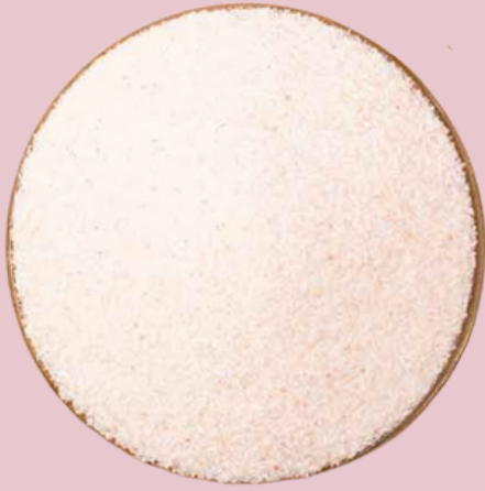
DPS-01 DARK PINK SALT POWDER

100% Genuine and Original Coarse Salt Crystals 100% Natural, Pure, Original and Genuine contains natural elements needed by the body. Unrefined, chemically untreated, Non-iodized & free from additives.