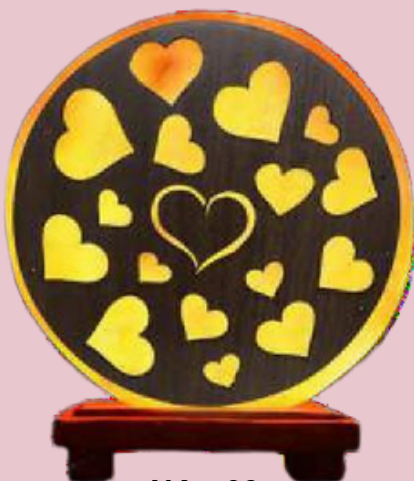
NA : 03 Heart