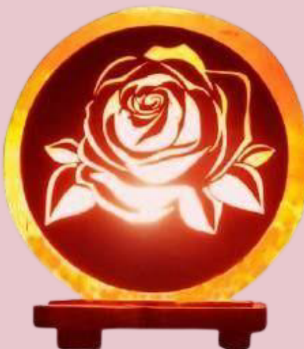
NA : 06 Flower