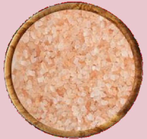
LPS - 03 Light Pink Salt Size 1 ~ 2 mm