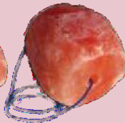
LS : 08