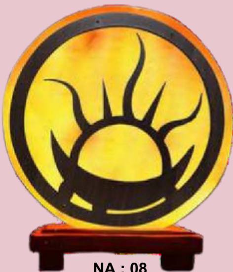
NA : 08 Sunlight