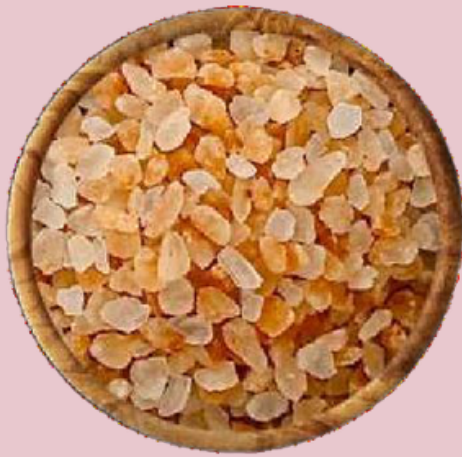
LPS - 04 Light Pink Salt Size 2 ~ 5 mm