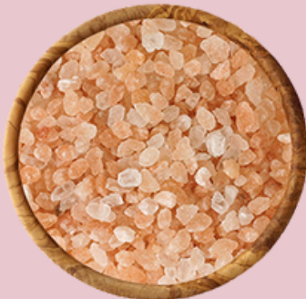
DPS- 04 Dark Pink Salt Size 2 ~ 5 mm