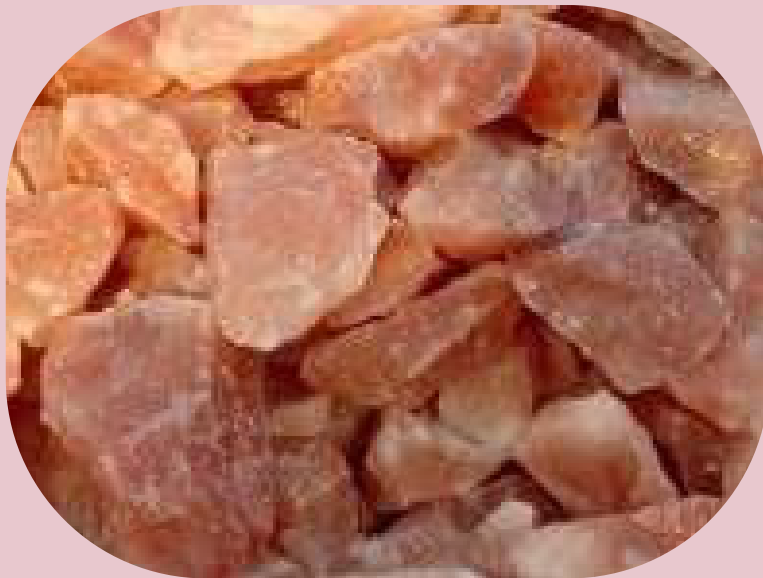
Pink Rock Salt Animal Licking 2 – 10 kg